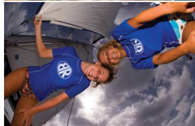
ROUNDABOUT Clockwise from above: A barcheek-trevally cyclone; Broachreachers under full sail; a halimeda ghost pipefish. Opposite: Fresh fruits and vegetables arrive at a floating market in the Solomon Islands.

without being underwater at all. If the hike is this awesome, I can't imagine what the day's diving will be like.